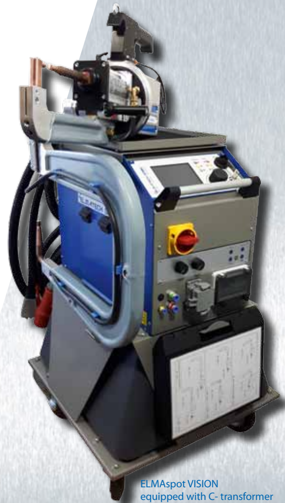
ELMASpot VISION equipped with C- transformer gun and internal water cooling