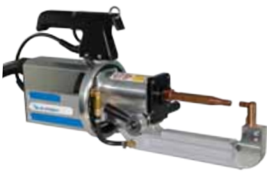
Spot welding gun ELMA VISION C